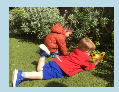
Light and reflections activity