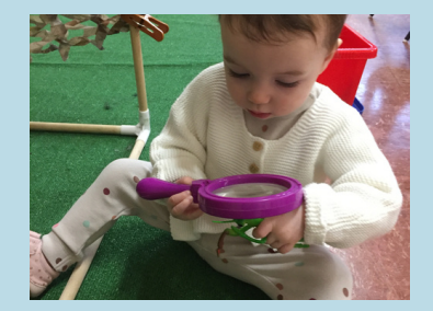
Learning and Exploring