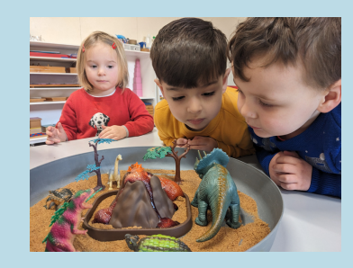
STEM Volcano erruption