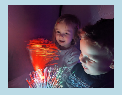
Sensory lights 'Milkyway' activity